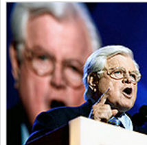
A Mannah of Speaking