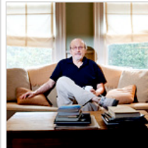
E. L. Doctorow Is Neat, Unlike His Characters