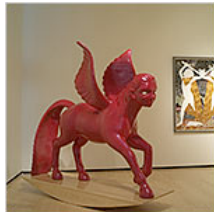
Contradiction, Vital to Pakistan and Its Art