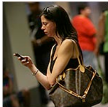
Customers Angry as iPhones Overload AT&T